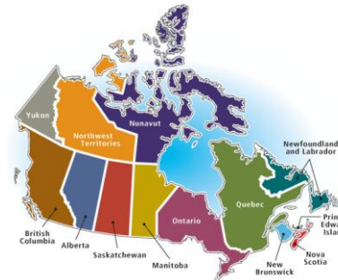
National, regional & local systems