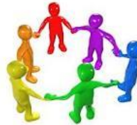
Alignment of ethics initiatives on streamlining